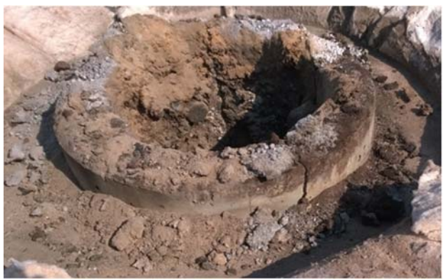
Fig. 2 Reactor lining with melted fuel parts and visible crack

Upon detection of cracks in the inner lining had to proceed with the reconstruction and adaptation of technologies. Modification was carried out in 2016. The reconstruction included: production of new inner lining, production of a new moving grate and adjusting the lower and upper part of the generator. [1-5]