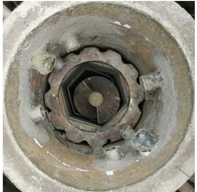
Fig. 4. The new lining generator with oscillating grid

have been designed to allow movement in two axes (horizontal and vertical). Double Axis movement prevents the ash from fueling on the walls of the reactor lining. Also it makes it easier to fall through the ash from the generator to the ash blowing agent. This oscillating grate allows you to test fuels that have a problem with crushing ash. The grate has been awarded model No. 29866. [1-5]