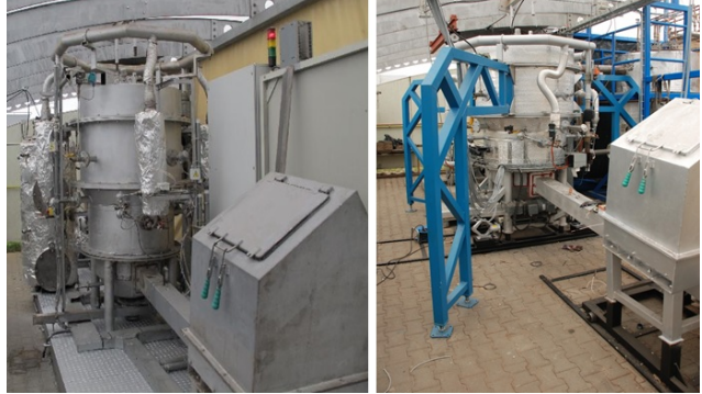
Fig. 5. Generator before and after reconstruction

The visual comparison generator before and after the adjustments made, see Fig. 5.