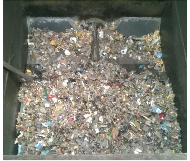
Fig. 6. Palozo II