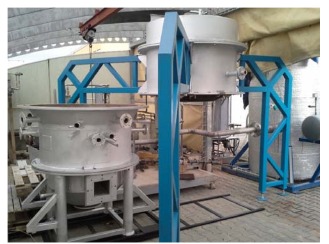
Fig. 3. generator on consoles

Reconstruction started by adjusting the lower and upper part of the generator. The adjustment of the upper part of the generator consisted in fixing the upper part of the generator to three beams, Fig. 3. The lower part of the generator was mounted on a structure with mechanical jacks and mounted on the rails. The lower part of the generator was mounted on the rails to simplify the dismantling of the generator. This has resulted in quicker access to the inside of the generator and the possibility to inspect the inner lining after the tests have been performed. [1-5]