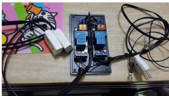
Fig. 4 Hardware modules

Water solenoid valve and heater relay module as shown in Fig. 4.