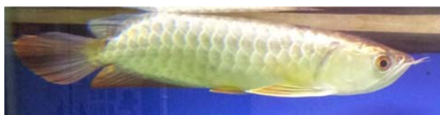
Fig. 1 Golden arowana

Golden arowana as shown in Fig.1 is the highest price for arowana of the same posture, featuring brightness of golden dragon scales. Besides golden color, other colors of purple, blue and green can also be found. The colors are presented with metal texture, and very stereoscopic. Since golden arowana is highly sensitive and nervous and can easily be stimulated, often due to damaging irritation. Golden arowana mainly come from Malaysia.