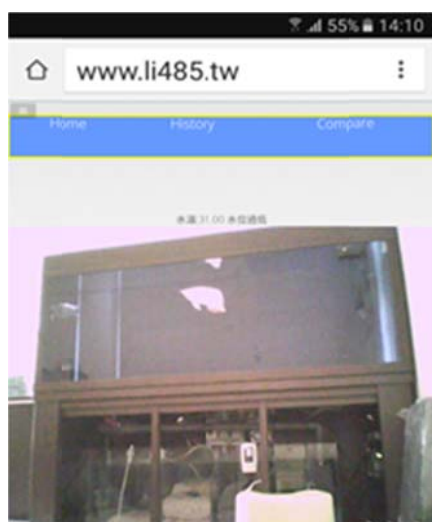
Fig5. Screenshot of mobile device

As shown in Fig. 5, the computer, tablet or mobile device can always monitor the status of water temperature and water level data and activities of arowana.