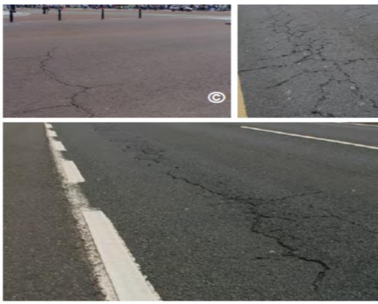
Figure 1 roads cracks defect

essence contributes towards the general condition raking of the street surface. Anyway, the inability to address this imperfection will probably quicken the basic disappointment because of water entrance. That deformity that degree for some separation is typically fixed during customized work. Figure 1 shows street splits [3, 14].