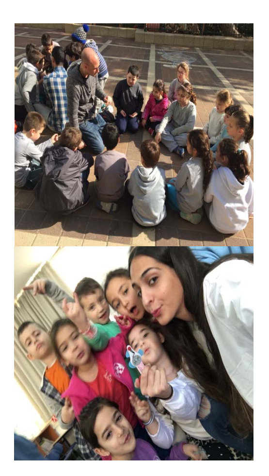
Fig.2: Presenting the principles (up) Solar energy (down) Wind energy

These lessons serve as a milestone for the students, who can pass their knowledge on to the pupils. By the end of the course, the pupils have been authorized by HIT as "Green Ambassadors" and receive certification giving first- and second-graders the obligation to act in accordance with rules to increase renewable energy and energy efficiency and protect the environment, such as turning off lights when leaving the room, shutting all windows when the air conditioner is operating, opening the shades to let in sunlight instead of switching on lights, and turning off the water when brushing their teeth. In addition, pupils have to present and disseminate the importance of the issue to their surroundings. The last stage of the course is an efficiency test conducted by statistical examination of the students' answers to questions on the questionnaire presented to students as a related trivia game show.