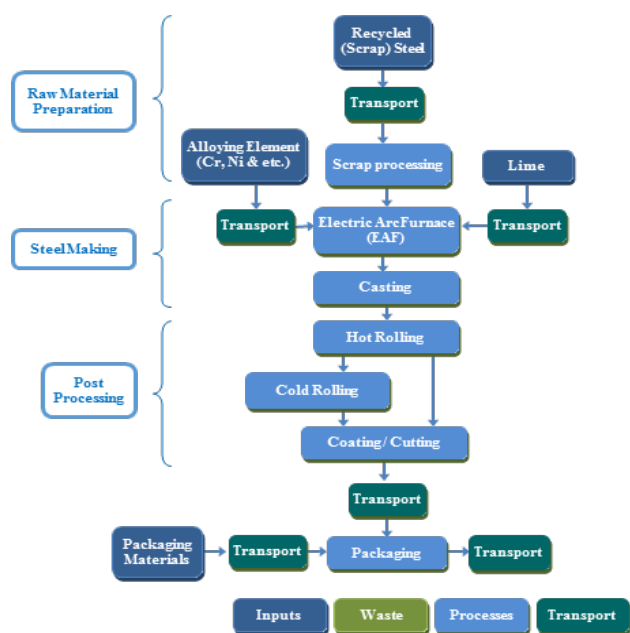
Figure 2: Process map of stainless steel manufacturing