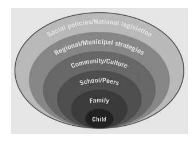
Figure 1.1 Sociological Model