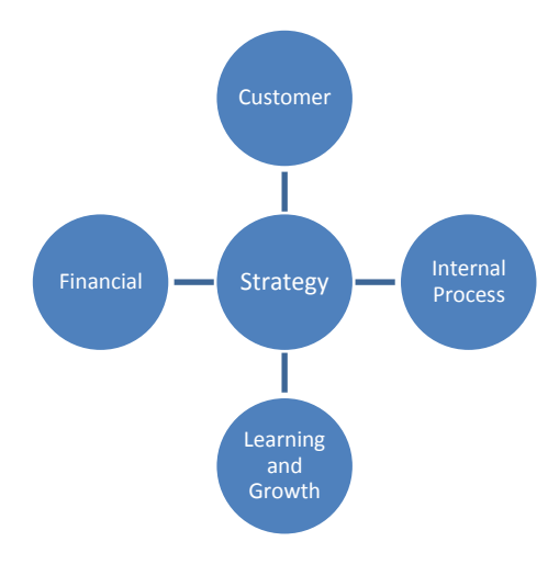
Figure 1. Balanced Scorecard

can be described as part of a device for evaluating the company's e-commerce performance.