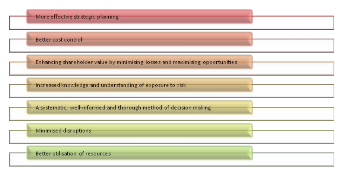
Fig.1 The advantages of risks management procedures

within the risk appetite, to provide reasonable assurance regarding the achievement of objectives [1]. Benefits of risk management and internal control in establishing and maintaining risk management procedures are as follows: