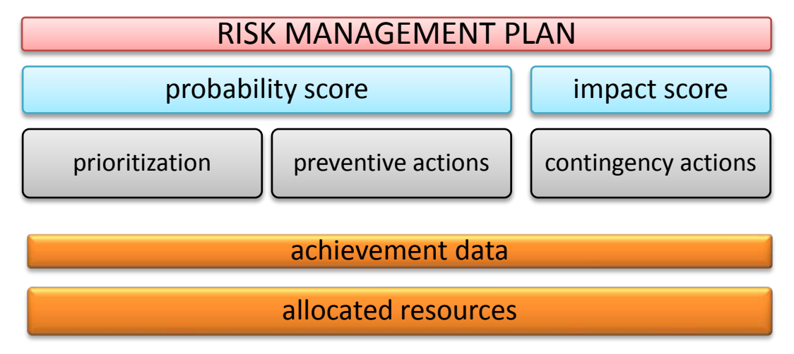
Fig.4 Risks monitoring process

Risk profiles and the priority risks to be managed change as activity development proceeds, resulting in an updating of the risk management matrix. The process of risks monitoring is illustrated in Fig.4.