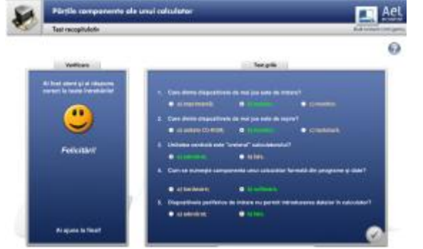
Fig. 5 The recapitulative test with all the correct answers

In Fig. 4 each student (user) is completing the crossword puzzle and then is validating the answers. After the completion of the Training, a summative assessment is carried out which includes: qualitative and quantitative testing of the student's learning of