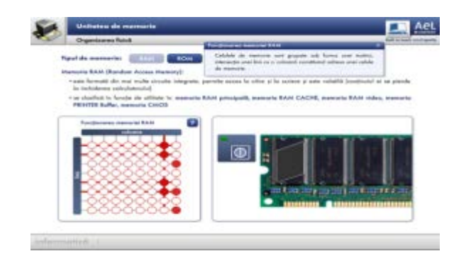
Fig, 2.Physical organization - RAM memory

Simulation of the "Memory Unit Lesson" is recommended for two hours of teaching and is made up of three parts: Logical Organization, Physical Organization and the Game (Fig. 1, Fig.2, Fig.3).