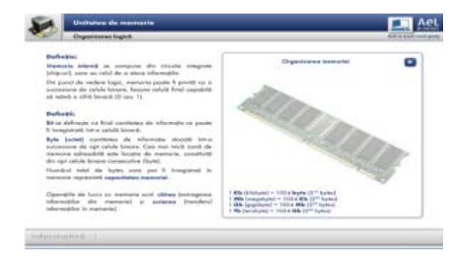
Fig. 1 Logical organization

introduced the 2016-2017 academic years and the 2 semesters. The connection to the AeL application was made through a user name and a password; they were entered into the Secretariat. In order to enter the AeL application you must be a teacher or a student. Connection to the application can be done only after a server computer or client computer students.