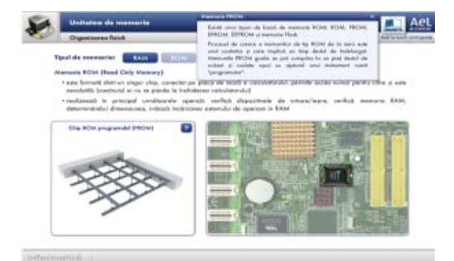
Fig. 2.Physical organization - RAM memory

In Fig. 4 each student (user) is completing the crossword puzzle and then is validating the answers. After the completion of the Training, a summative assessment is carried out which includes: qualitative and quantitative testing of the student's learning of