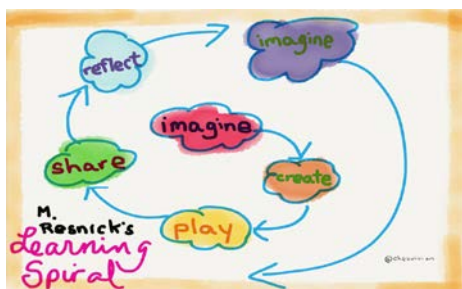
Fig. 2: Learning Spiral from Media Labs MIT by Mitch Resnick

c) The third English Scratch project (“English Scratch Project 3”) was thought to be a theme-free work, based on the English Curriculum topics. The students worked in groups of 4 and they chose their topic of the project by themselves. They were also asked to define their whole project, which included following a plan that was then simplified not to be an obstacle instead of a help to the development of the whole project, making of it a real and effective way of following and using the Mitch Resnick’s Spiral for Computational Thinking (Fig.2).