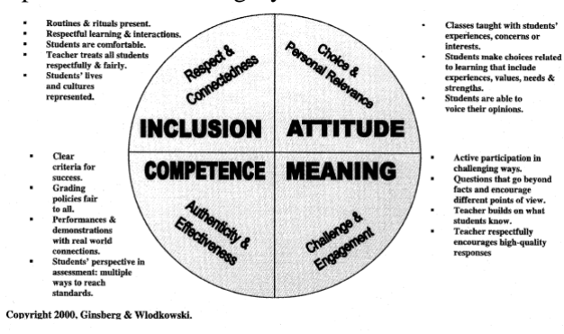
Figure 1 The motivational framework for culturally responsive teaching.

The Motivational framework for cultural responsive teaching (Figure 3), developed by Ginsberg and Wlodkowski [7], synthesizes concepts from the multiple disciplines to inform a comprehensive understanding of motivation that teachers and students actively create together. The motivational framework is the second tier of a CALM approach to integrating learning theories imbued with numerous principles of intrinsic motivation and respect for cultural integrity.