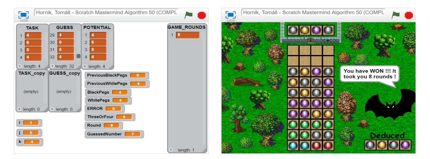
Fig. 2. Side by side comparison of the game. Graphical visualization is on the right side, whereas hidden graphics with most of the variables and lists shown is on the left side.

Nesting of IF-ELSE blocks is in this case far superior to basic IF conditions not only because when the correct option is found the unnecessary code section is skipped, but also because if the correct option is not found, the ending section can terminate the program and write an error message. This error message can be changed in context of the place where it happened within the program and thus it can make bug hunting process (= tracing errors within the program [9]) much easier.