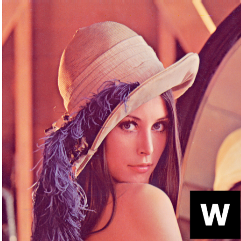
Figure 2: Image with watermark embedded