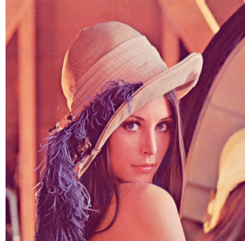
Figure 3: Image with watermark removed

was explained in Algorithm 1, which is further defined via the pseudo-code.