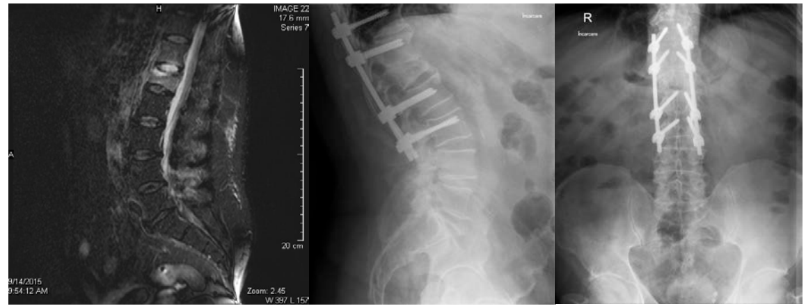
Fig. 2A Case 9: 66 year old male with T12-L1 Salmonella infection. Fig 1A pre-op MRI showing disc abscess, Fig 2B and 2C post-op x-rays with partial fusion at affected level

Case 8: 53 year old male with L5-S1 Pseudomonas Aeruginosa infection. Fig 1A pre-op x-ray; Fig 1B and 1C post-op X-rays with complete fusion at affected level