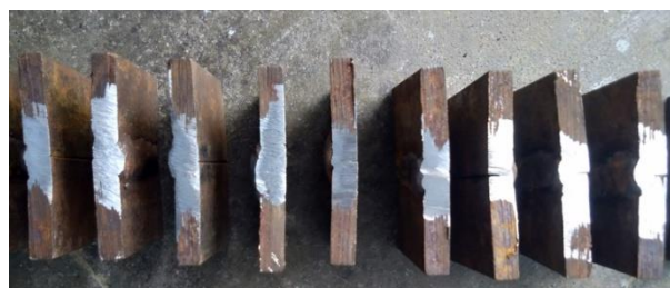
Fig 1 Experiments 1- 9