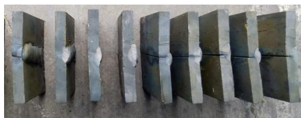
Fig 2. After Etching 1-9