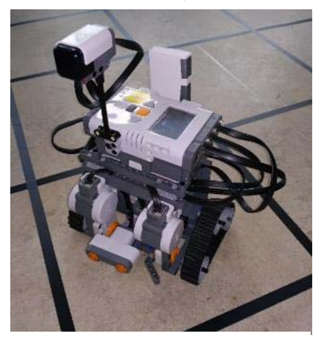
Fig. 3. KarelNXT robot construction

Considering the size of the robot a room was created with the help of the duck tape on light straight pad. Length of the square field side is 30 centimetres. From the child construction set blocks are built in a way they represent the walls in the room so that it would be possible to built even irregular rooms. The bricks demonstrate rollers 2.5 cm in diameter and 0.7 cm high with the inclined edge of 0.3 cm in 45 degrees. The bricks are made up of hard wood and painted red. The amount of the bricks in one field is limited by one brick.