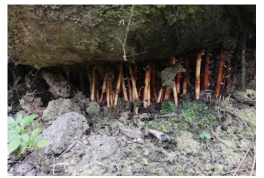
Figure 5. New Roots Growth

In the observations made in 2018, the growth of the roots of oil palm has progressed quite well, as evidenced by the growth of new roots, as can be seen in Figure 5 . The growth of new roots helps plants to absorb water and soil nutrients to meet plant needs. The growth of new roots also gives the plant the possibility to survive for a longer time.