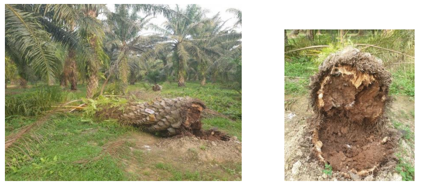
Figure 2. Fallen tree due to Ganoderma attack on the control block