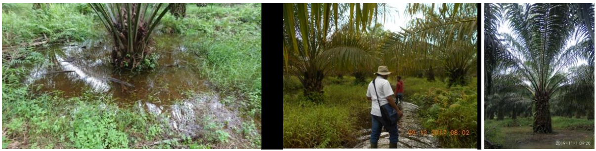
Figure 1. The condition of the garden was flooded

Based on rainfall data from 2017 to 2020, it can be seen that this research area often rains which causes this area to be inundated with water for up to 1 full month from the end of the year to the beginning of the year. Several factors affect the productivity of oil palm: climate, area shape, soil conditions, planting material, and cultivation technique [21]. Furthermore, Risza states that plant age, total plant population per hectare, soil preservation systems,