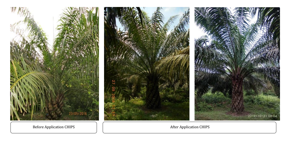
Figure 3. Comparison of Plant Conditions

plants are indicated by yellowing of all the fronds, while in older plants that are infected by Ganoderma, the fronds will hang or get stuck. Based on the severity of the attack in Figure 3, BSR disease is more difficult to observe externally in the early stage than in the severe stage. This is due to the slow progression of the disease. External symptoms are difficult to observe in an early stage because it shows similar characteristics with the condition of the palm oil with water deficit, nutrient deficits, stagnant or termite attack symptoms. External symptoms are more easily observed in adult plants through dry midrib and spear leaf that does not open [24].