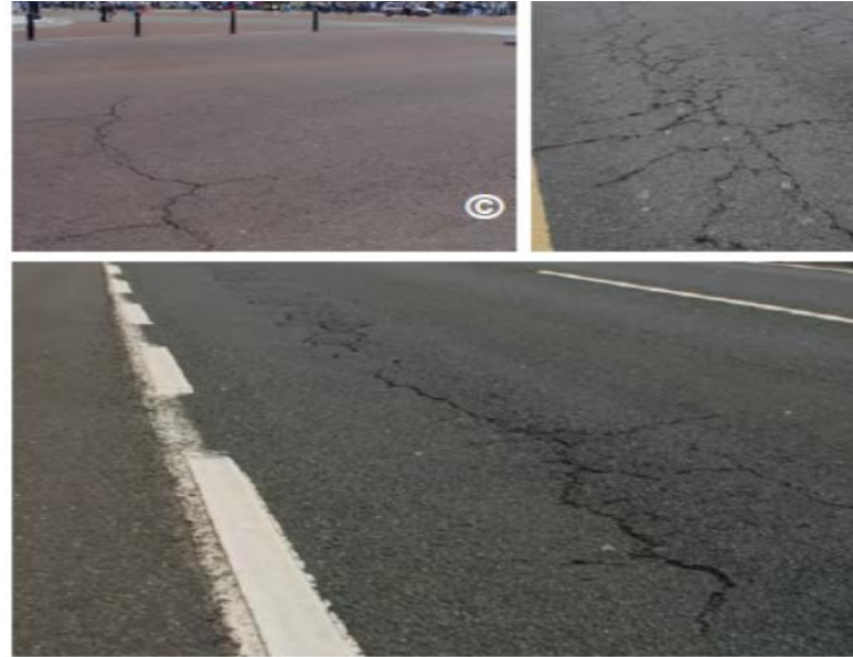
Figure 1 roads cracks defect

essence contributes towards the general condition raking of the street surface. Anyway, the inability to address this imperfection will probably quicken the basic disappointment because of water entrance. That deformity that degree for some separation is typically fixed during customized work. Figure 1 shows street splits [3, 14].