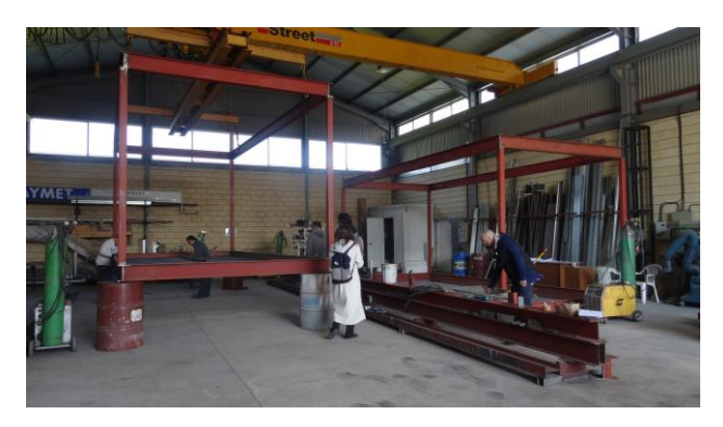
Figure 4 Images of the assemblance process of the structural frame of the units, which is consisted by two main units, thus forming a small family house.

The team is currently in the process of developing a prototype, which also allows for the formation of clusters, as it consists of two main units which form a small family house (Figure 3, Figure 4).