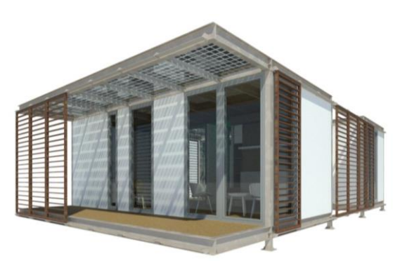
Figure 2 Three-dimensional photorealistic representation of the result.

The structural system as described in paragraph 3.3, allows the proposed unit to expand in both horizontal and vertical axes up to two floors, thereby giving the option to adopt several layouts which could result in a unit of 40m^2 or 60m^2 depending on the needs of the prospective users.