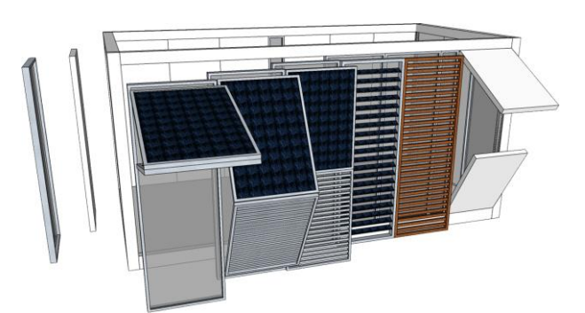
Figure 3 Illustration of the shell of the unit; formed by assembling panels.

The design decisions described above, led to a core unit of 21m^2 due to a seven by three grid of one-meter intervals with a shell created by 80-millimeter thick Ecopanels. The shell of the unit is formed by assembling panels, which may be installed and disassembled by a relatively straightforward procedure, making the unit very flexible in terms of assembly (Figure 2).