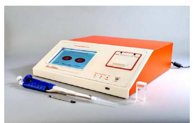
Figure No.2 LED Fluorimeter (Quantalase LF-2a)

For the estimation of uranium content from the collected water samples, LED fluorimeter (Quantalase LF- 2a) was used (Fig.2)