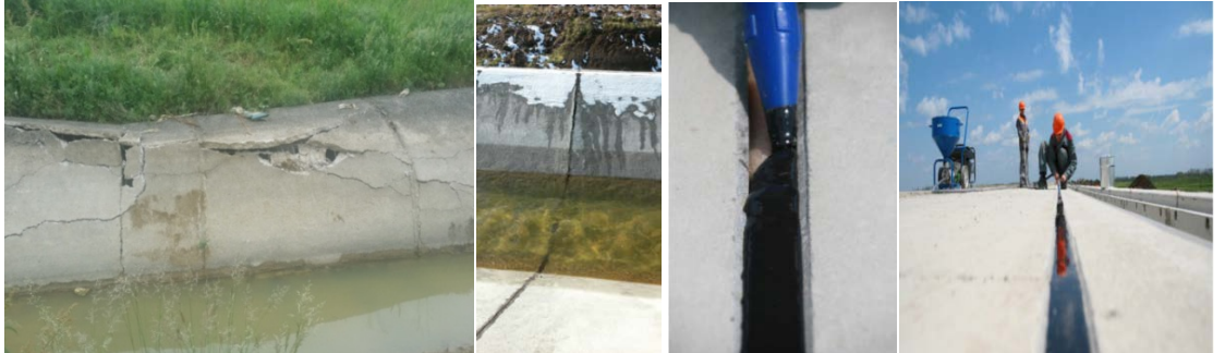
Pictures 4, 5,6&7. Current status of a partially restored canal and the rehabilitation canal with the Fuga materials

snow. The greatest losses are in the distributive canals. These structures are built of concrete. The length of the open canals, aquedutes, and cross-overs from the starting point of the canal, are approximately 24500m. The length of the canal with a trapeze shape is 18913.85m, where, up to this moment, 80% have been rehabilitated, of which the failure of modern material technology is easily noted, specifically in the material joints (see picture 4,5,6&7).