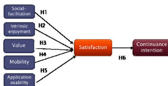
Fig. 1. Conceptual framework

Based on the relevant literature reviewed in this section, a conceptual framework is proposed (Fig. 1). The framework proposes constructs that are measured through customer experiences, which are social-facilitation, intrinsic enjoyment, value, mobility, and application usability, in addition to the traditional relational constructs of satisfaction, Edvardsson et al. [36] believe that the satisfaction is the customer's continuance intention to buy and repurchase the same brand of products and services with the same seller. As a result, Hypotheses are proposed as Figure 1: