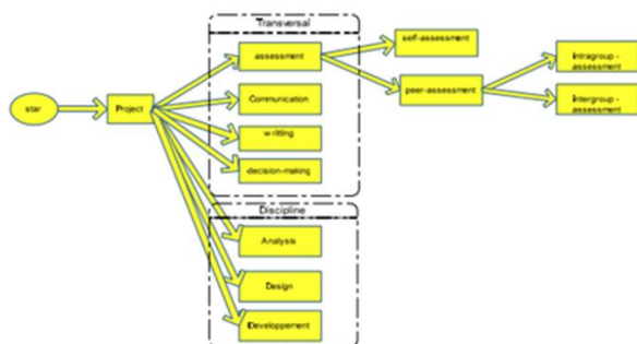
Fig.1 The assessment process in project

Online peer learning and assessment in the collaborative learning process in higher education practice are examined with respect to the learners' experience and reactions to that experience. The assessment has underlined as a critical success factor of online education. Based on the theoretical framework of CHAT and the application of the Adobe Connect program, the study examines how learners in an online context can be collaborative and social with the support of this program. . Therefore, the study addresses the idea that peer learning and assessment are critical to encouragement the quality of the online learning and teaching process in the higher education system, and it attempts to show that the contributions to the field are practical applications of online education studies. Limitations of the collaborative learning environment may be investigated in detail, and higher education institutions may develop their own organizational and pedagogical models that improve practice and give insights on the value of these models and their limitations. [22]