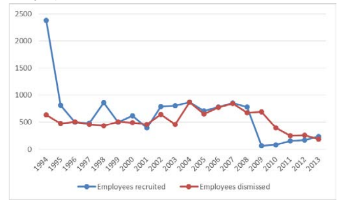
Fig.1: Staff turnover at the SRS

should be noted that, since 1994, the number of workers in the field of customs and taxation with higher education grew rapidly - from 34% to 93%, in 2012.