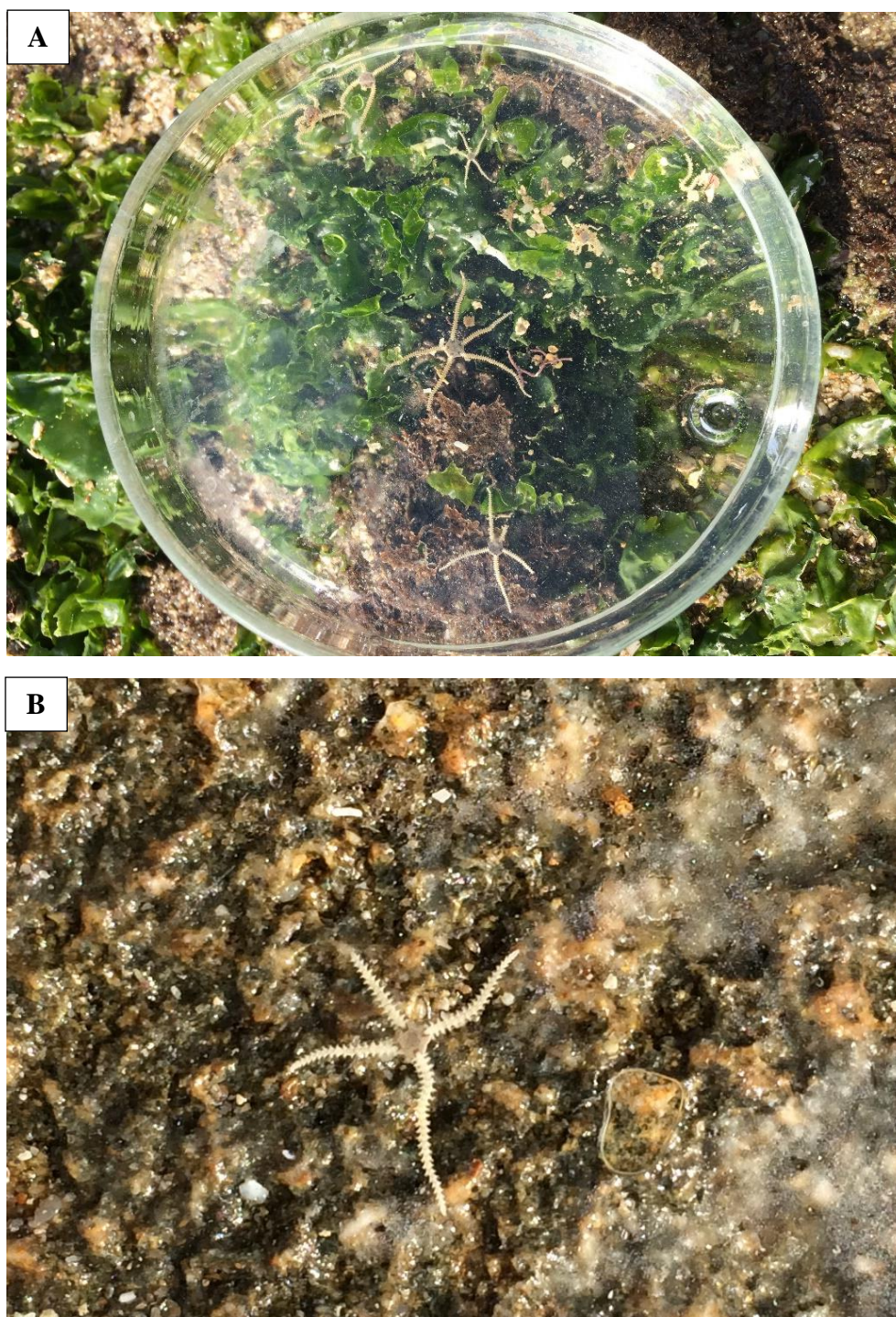
Fig.4 A- Normal form of Amphipholis squamata , B- Abnormal A. Squamata with four arms.