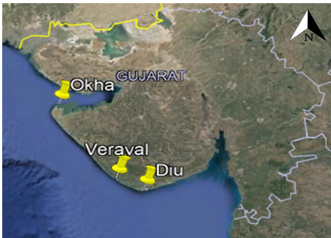
Fig.1 Map of the study area (Courtesy Google earth).