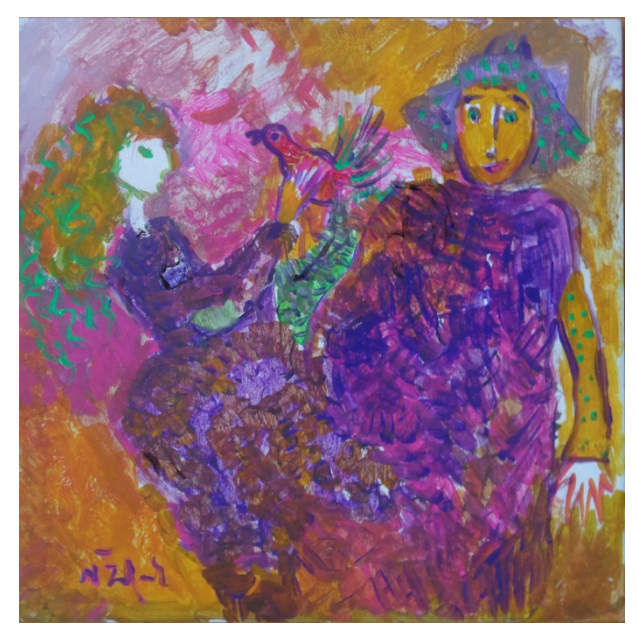
Fig. 5a, Ceramics, Nada's painting in two spectra Spectral analysis and photographing with blockages are going to provide the painters with more information about the dye diversity considering the response in the visual and in the NIR spectrum. Painter Nada Žiljak paints a "graphic with sense". Separate drawing for a NIR observation. Separate drawing for a naked eye observation.

When working in the field of forensics, it is recommended for the art work to be recorded with eight light blockages. This is a procedure that is going to protect the author, the collector, the gallerists and the museum. Multiple VZ recordings of the art work guarantee the authenticity of that art work when verifying originality.