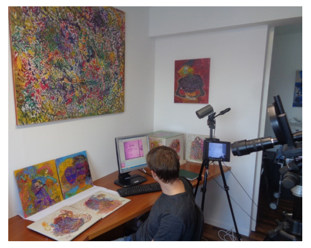
Fig. 7a, NIR laboratory (RGB)

image is being materialized. It was an incentive and a reason to develop a new graphic method of connecting two photographs for printing with process dyes [7].