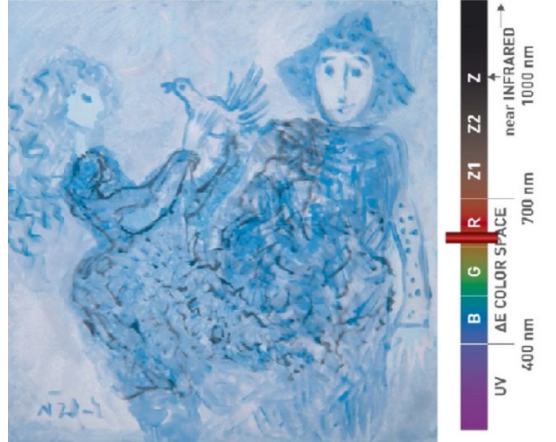
Fig. 6, Picture with a blockage at 700 nm with the address to animation. http://jana.ziljak.hr/AnimacijaFigure4.mp4

Generaly, infrared painting have been given as an animation created after recording in 12 light blockages.