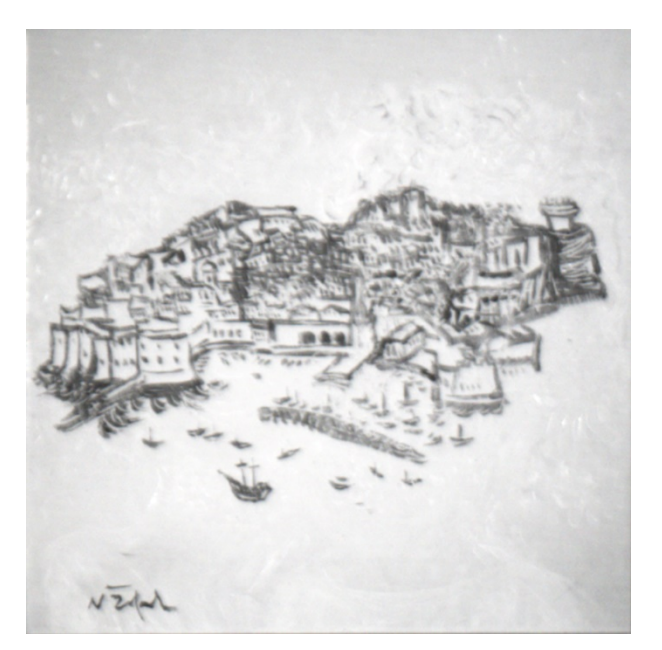
Fig. 4 c, Masks Dubrovnik, 850 nm

When working in the field of forensics, it is recommended for the art work to be recorded with eight light blockages. This is a procedure that is going to protect the author, the collector, the gallerists and the museum. Multiple VZ recordings of the art work guarantee the authenticity of that art work when verifying originality.