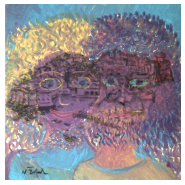
Fig. 4 a, Masks Dubrovnik, 475 nm

Masks in Figure 4 have been photographed with four cameras: visual and blockages at 475, 695 nm and 850 nm. The first blockage infiltrates the yellow color (560 nm). Even the smallest absence of one part from the visual spectrum disrupts the hiding of Z image that is slightly looming. The silhouette of the City of Dubrovnik appears significantly in the following light blockages: 690 nm where the red color disappears. The complete blockage of RGB visual components of our eye is being shown with a blockage at 850 nm. No trace are seen of the masks