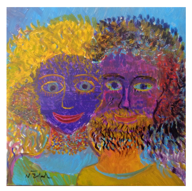
Fig. 3, Masks with the hidden silhouette of Dubrovnik, V (RGB)Figure 3 Masks with the hidden silhouette of Dubrovnik, V (RGB)

Theory and application of INFRAREDESIGN® are being observed with two recording cameras, or two photographic cameras, or with security cameras situated on streets, in banks, as expanded observation at night (7). Near infrared spectrum is being observed in its initial area in the range from 750 to 1000 nm. This area is split into two parts. The first part, marked as Z1 is a transition area from the visual to the infrared spectrum, is being separated because it is a mixture that we are blocking on purpose. Cameras for observing effects of IRD® printing procedure have been set to the area of light at 1000 nm (Z) (8).