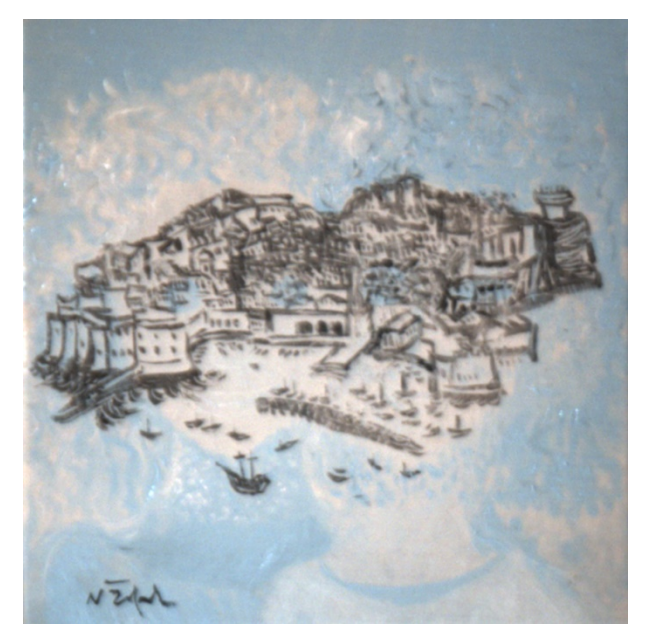
Fig. 4 b, Masks Dubrovnik, 695 nm

from the visual spectrum. Only the drawing remains, the graphic of the city of Dubrovnik.