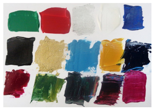
Fig.1a, A photograph of ceramic dyes in visual spectrum

Colors for art painting on ceramics shown in Fig 1 have been recorded with a double VZ camera in visual RGB spectrum and in NIR spectrum with a blockage at 1000 nm. The first nine colors are the manufacturer's pure colors. Green, red, silver, white and blue (ultramarine). In the second row there are black, gold, cyan, yellow and a mix of cyan and black (50%, 50%).