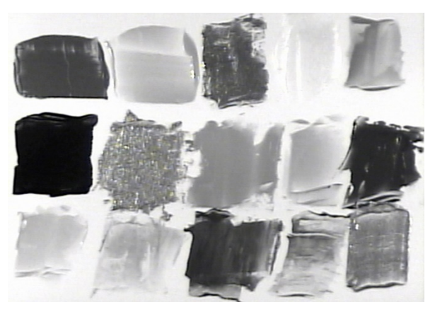
Fig.1b, A photograph of ceramic dyes in NIR (1000 nm) spectrum

Each dye is being assigned value Z (table 1) that represents the information about the level of appearing in NIR-Z. Photographing with a duality is an innovation that protects the author and the picture's collector. It is vital information for the artist when they are performing the hidden image separately for the visual and the NIR spectrum value Z covering is the darkness that has been registered by the NIR camera with a blockage at 900 nm. This is being registered by the machines for banknote (checking in banks), night IR camera on the street, video recorder in the "night shut" mode, binoculars on military or hunting rifles. NIR - Z photo cameras are being set on contrast. Absorbance with a value 0.2 is being set to information of total 100% covering.