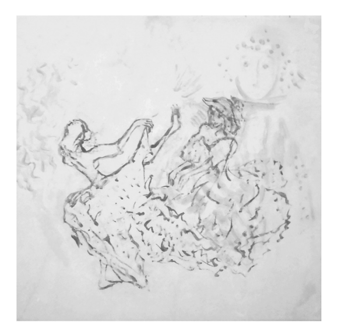
Fig. 5b, (mask, 1000 nm)

Inventive movement "INFRARED painting" is using the knowledge about the property of dye light absorption for ceramic art. The painter mixes dyes with the intention of having two images for two different light blockages on ceramics. The superior intimacy, extreme message, hidden information, extreme eroticism is not going to be visible to the naked eye.