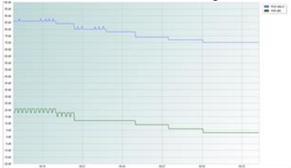
Fig. 3: SNR x RSSI

initially was analyzed the operation of the modem conditions of scenario 1 above, where the modems were connected directly to each other with a 100m cable between them just where he passed the signal generated by the PLC. In this situation was expected that in whatever chosen modulation even without the FEC activated, the signal data transmission errors not present and also the SNR would be low, as there were no external interference and impedance of the wire was too low to affect the transmitted signal.