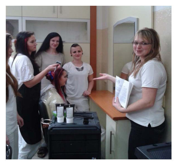
Fig. 3 Teaching of the practical lesson teacher

examples of dyeing (Fig. 3 and 4) at the practical lesson by the teacher and students.