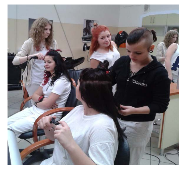
Fig. 4 Practical exercises of students